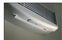
Night light and sensor