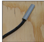
10' (3 m) floor sensor